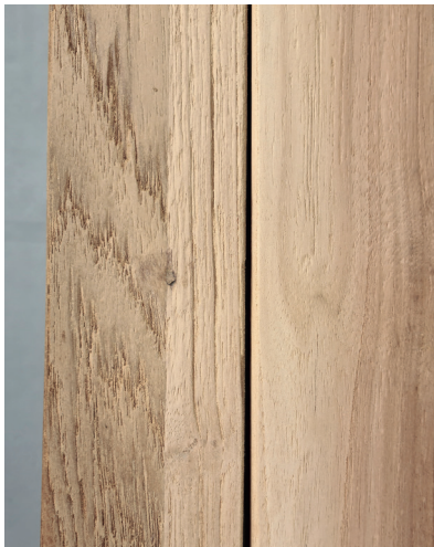
example of discolouration

Grains, knots, discolourations, and adhesive joints are all characteristics of teak garden furniture. The quantity or size of these features can greatly differ from one piece of furniture to another. This does not affect the quality but instead makes each piece of furniture entirely unique.