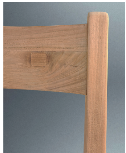
examples of filler pieces in reclaimed teak wood