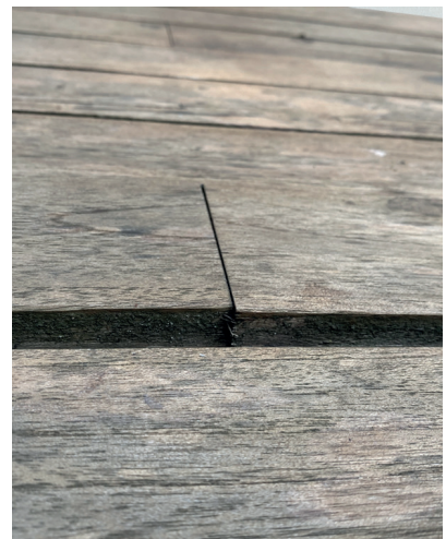
examples of teak roughening and warping