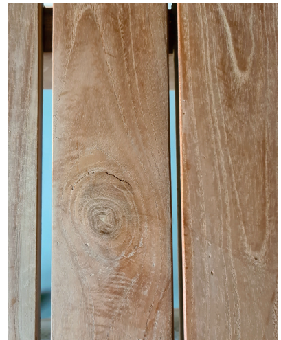
example of a knot

You can recognize reclaimed teak garden furniture by the filler pieces. The size and locations of these pieces may vary from one furniture item to another. Because they are thoroughly glued and sanded, these pieces do not affect the quality of the teak garden furniture.