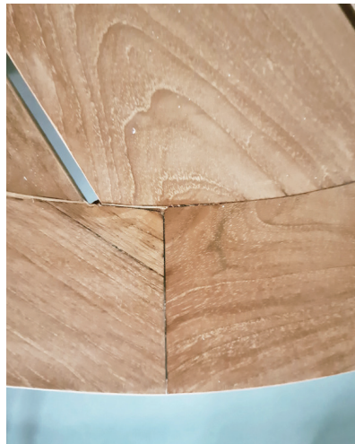
example of a glue joint